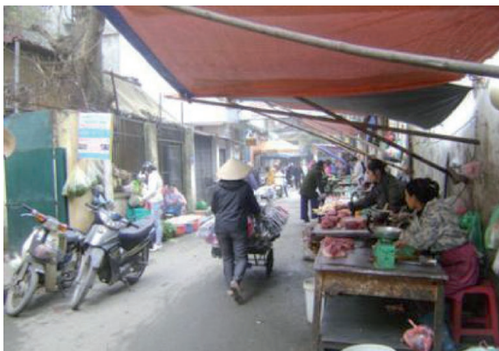
Livestock and poultry meat in abundance just outside the Veterinary Clinic.

http://hanoimoi.com.vn/Tin-tuc/Ban-doc/575433/cho-coc-gay-o-nhiem-khu-dan-cu